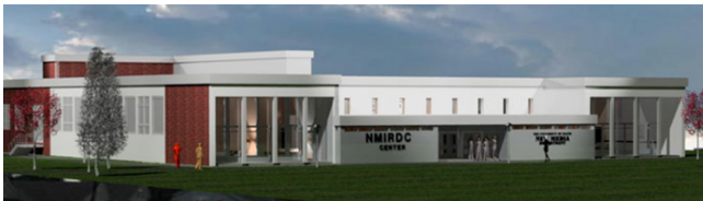
Architectural rendering of the NMIRDC building

This Center, the New Media Innovation, Research, and Development Center, will support expanded innovation and development in New Media and Intermedia for the State of Maine. The Center's general aim is to support and foster a new "culture" of innovation and creativity for the state of Maine by establishing needed technical facilities for continued and new training, research, and development; pursuing collaborative research and development initiatives with potential for beneficial economic and social impact; and working directly with individuals and businesses to take ideas and prototypes through the stages of development to commercialization.