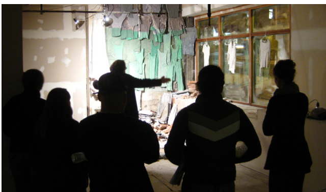
Site specific installation show in old downtown Bangor