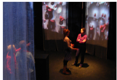
Collaborative work presented in the Pavilion Theatre